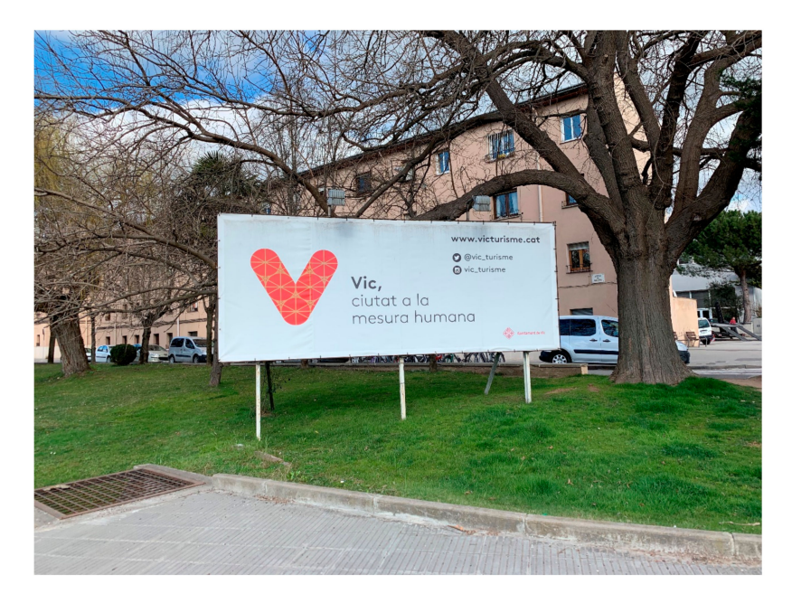
Figure 3. The new Vic brand was used in different off-line communication actions, such as the tourist campaign murals on the road, as is shown in this picture.

Nevertheless, the brand's deployment was not fast due to the three months stand-by period between the municipal elections and the configuration of the new city council that had to lead the implementation plan. In this regard, municipal elections usually slow down those unfinished projects when they are called. However, previous political consensus allowed new representatives to start the implementation plan in September 2015 and to use the brand as a city umbrella brand [13] with the purpose of creating a common narrative for all the residents, as well as using it in the official communication campaigns and support: off-line (basically, murals on the road) and online (11 Twitter accounts, 8 Facebook accounts, 2 Instagram accounts, 2 YouTube channels and 1 LinkedIn account).