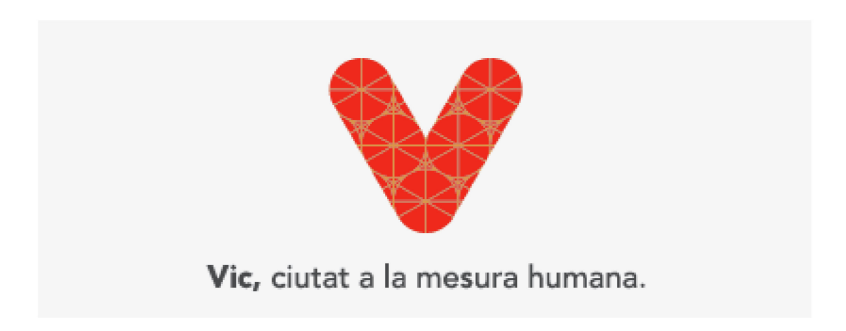
Figure 1. Logo and slogan (in Catalan) of the new Vic brand: "Vic, a city with a human dimension".

First, at the brand design level, the Vic brand wishes to be integrative, representing not only the city but also the region it is an integral part of: Osona. Second, the brand should be inclusive. At certain times during the fieldwork (see Sections 5.1 and 5.2), the concept of "inclusive city" regarding the multicultural character of Vic appears, which contrasts with the positioning that the city has had in certain media due to the rise of the far-right party PxC.