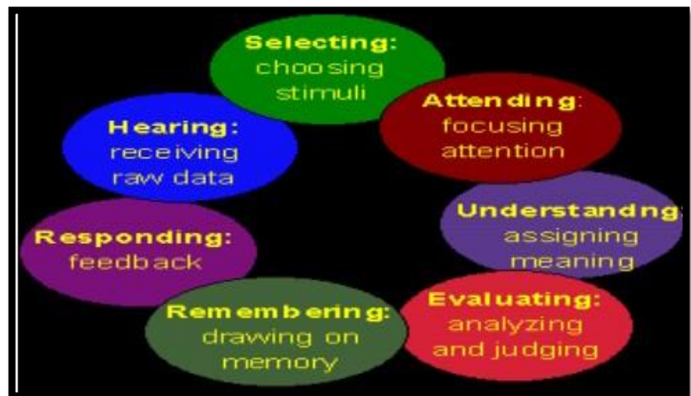
Figure 1: Basic stages of listening process and their functions. (Nunan, 2001, p. 24)

only of speech such as rate of speech, clarity of intonation and pronunciation, hesitations, pauses- (Cakir, 2011, p. 1802). Internalizing all these aspects is not an easy task, for this reason, there is a process that each child follows when he or she listens to an audio recording. This stages occur in a sequence and in a rapid succession. Nunan (2001) indicated that listening is a six-staged process, consisting of Hearing, Attending, Understanding, Remembering, Evaluating and Responding (Nunan, 2001, p.23). These means that listening is not an easy job and while students are